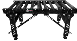
Heavy Duty Roller Table